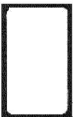
5. Fully coated surfaces

Actual floatation coating instructions are as follows :